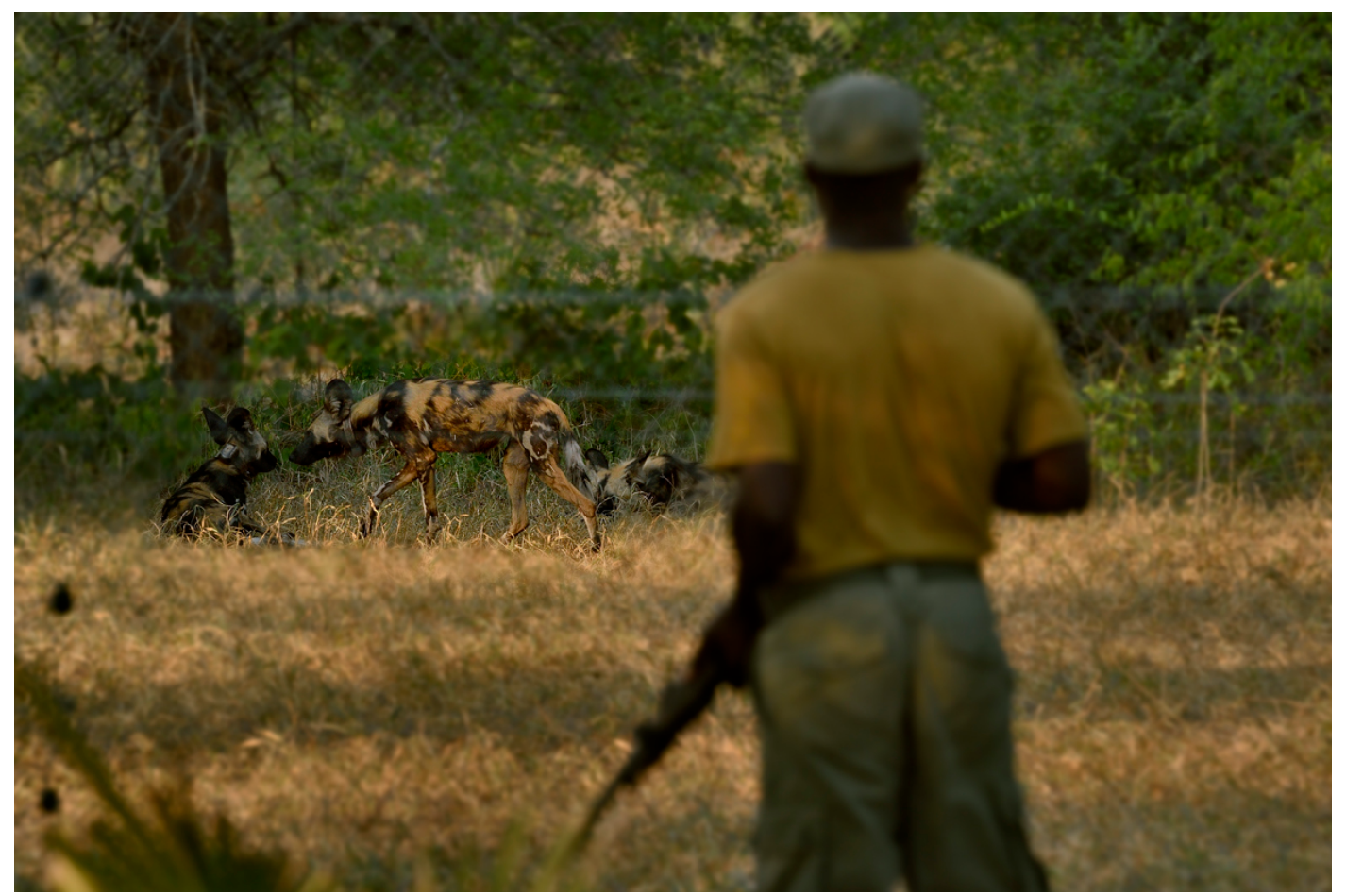
The new pack of Painted Wolves at their boma at Gorongosa National Park

On April 16, 2018, in a bold and innovative move to reverse the fate of Painted Wolves in southern Africa, the partnership between the EWT and Gorongosa National Park ensured the reintroduction of the Park's first pack of Painted Wolves in decades. This was a landmark occasion, as Painted Wolves have not been reintroduced to any park, protected area, game reserve or other space in the history of Mozambique. That truly represented conservation in action – an ambitious venture to restore Wild Dogs to an incredible ecosystem, and the initial 14 Painted Wolves, adapted so fast that now they became 40, as three females gave birth to 26 pups.