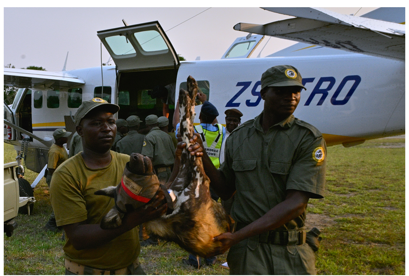
One of the new Painted Wolves at arrival at Gorongosa National Park

With only around 6,600 Painted Wolves left in Africa, this iconic species is one of the Continent's most at-risk carnivores and is listed by the IUCN as 'Endangered'. Urgent action is needed to save them. A key conservation strategy is to reintroduce Painted Wolves to viable ecosystems where they once ranged. The Painted Wolves (Lycaon pictus) is a canid native to sub-Saharan Africa. It is the largest indigenous canid in Africa, and the only extant member of the genus Lycaon. The Painted Wolf possesses the most specialized adaptations among the canids for coat colour, diet, and for pursuing its prey through its running ability. It possesses a graceful skeleton, and the loss of the first digit on its forefeet increases its stride and speed.